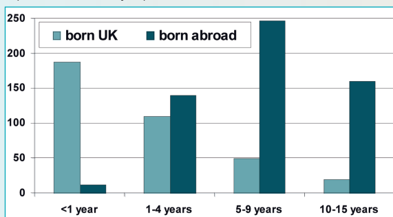
Table 1: Age at diagnosis: children diagnosed since 2000 in the UK, reported to NSHPC by September 2008

To date, about 1,700 children under the age of 16 have been diagnosed with HIV in the UK. Of these, 95% (1,600) were 'vertically infected' (where the HIV passes from mother to child), and just under 50% were born abroad. In 2007 about 1,000 under-16s were being seen for HIV care. This included about 80 newly diagnosed children, of whom about 60% were born abroad.